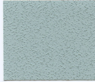
GREY STONE 232