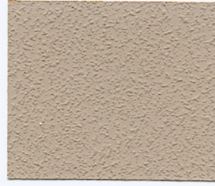
COUNTRY BROWN 207