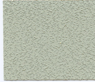
SAGE BRUSH 209