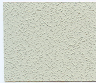
MALIBU BEIGE 234