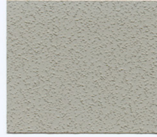
PEBBLE BROOK 229