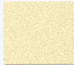
PALE STRAW 231