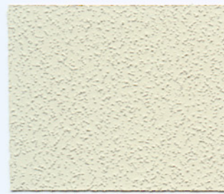
FRENCH CREAM 237