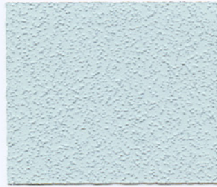
BLUE SKY 212