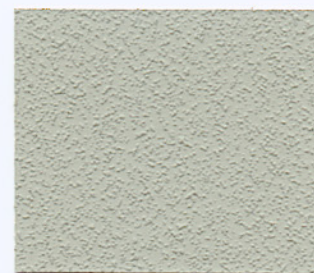
BURNT UMBER 223