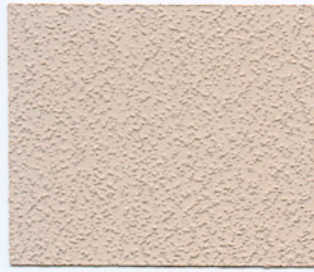
ROSE WOOD 215