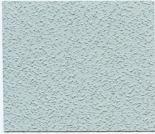
STEEL GREY 233