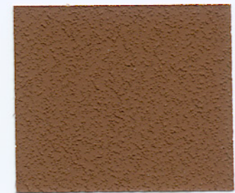
TERRA COTTA 240AB*

Variations in color and texture may occur due to local weather, job site conditions, tinting and applicator techniques.